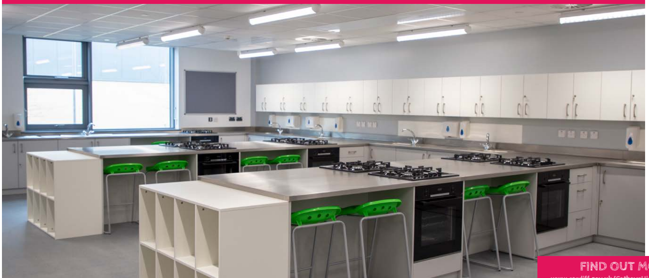
Cardiff West Community High

If the proposal goes ahead, another equality impact assessment would be carried out at the design stage. This would identify accessibility to the new build high school site. The equality impact assessment would take into account policies such as the Equality Act 2010, TAN 12: Design 2014 as well as building regulations such as BS8300, Part M and relevant Building Bulletins.