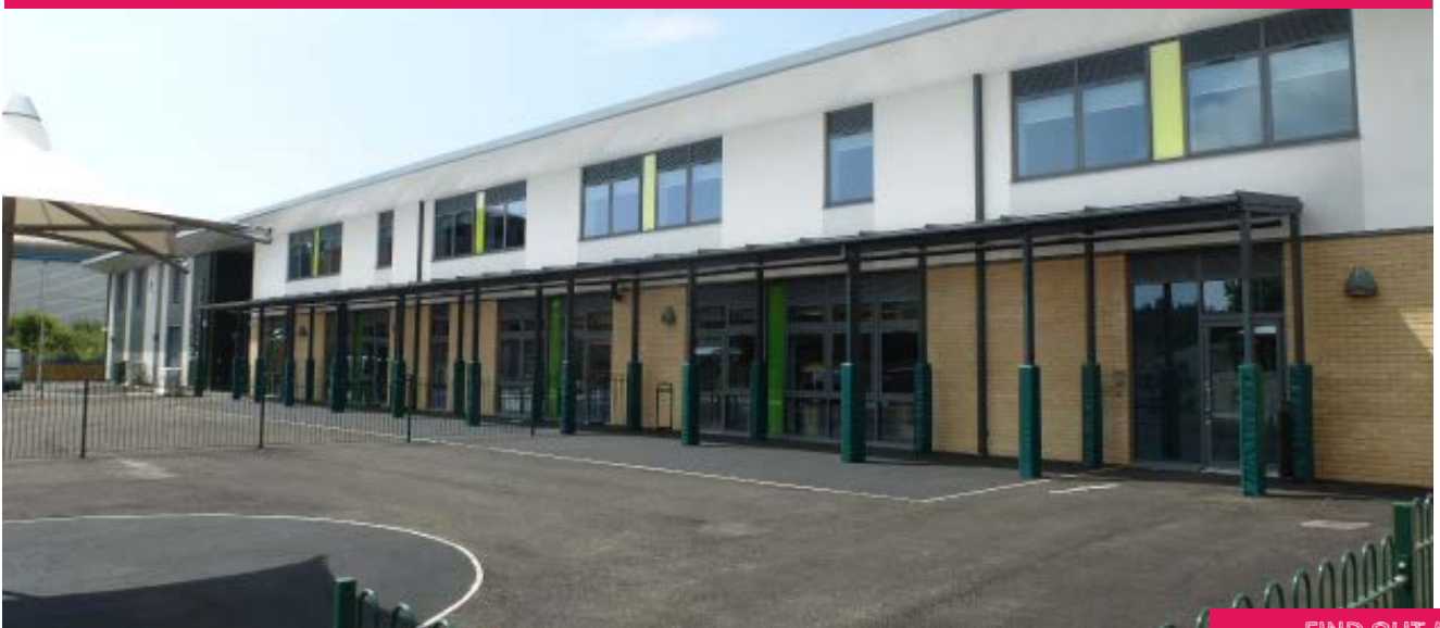
Recent new build primary school in Cardiff - Ysgol Glan Morfa

Approximately £17m, or 14%, of maintenance and condition issues of the estate were addressed through Band A of the 21st Century Schools investment programme. There has been significant investment in the construction of two new high schools in the East and West of the City, new primary school provision and suitability works undertaken in primary schools.