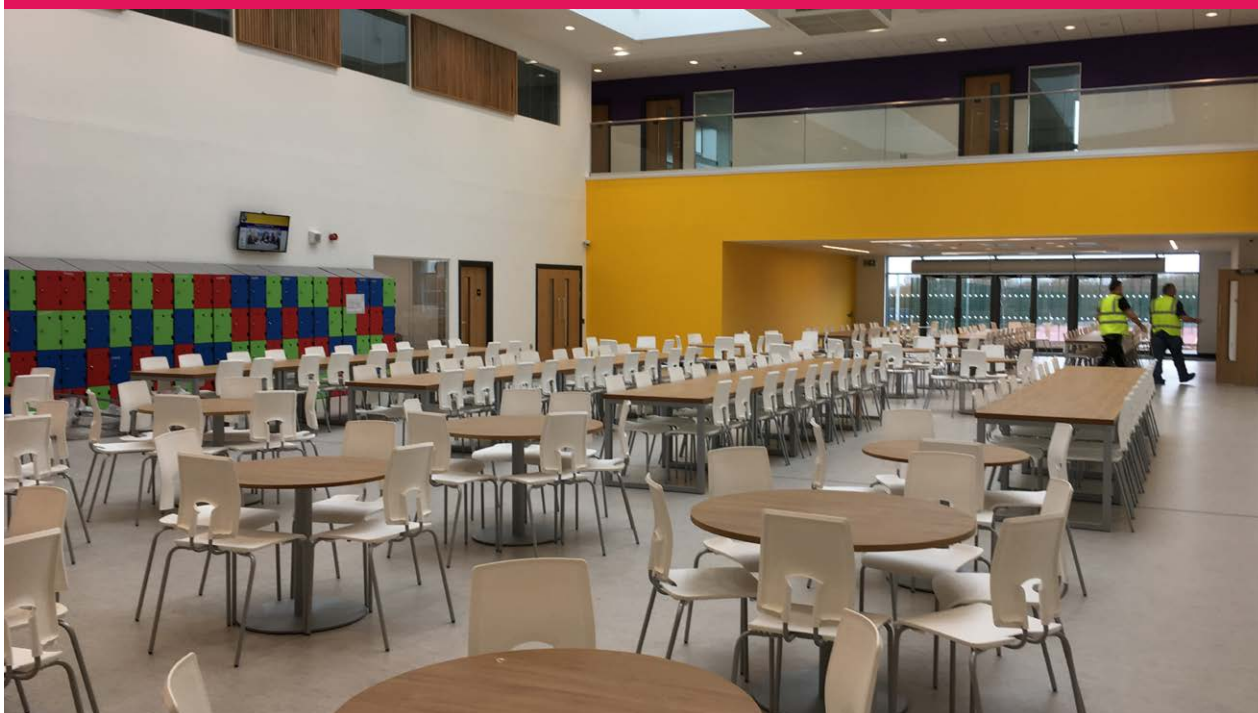
Eastern High School

Further HR implications of the proposal would need to be determined as the project develops, particularly in relation to the operation of the MIM scheme outlined above. Further guidance is required from Welsh Government to understand the full working arrangements in relation to facilities management to assess the impact, if any, on current school staff. The Governing Body and the school's leadership team would also need to consider whether any staffing changes are required to support the use of school premises by the wider community. HR People Services will provide advice and support as necessary.