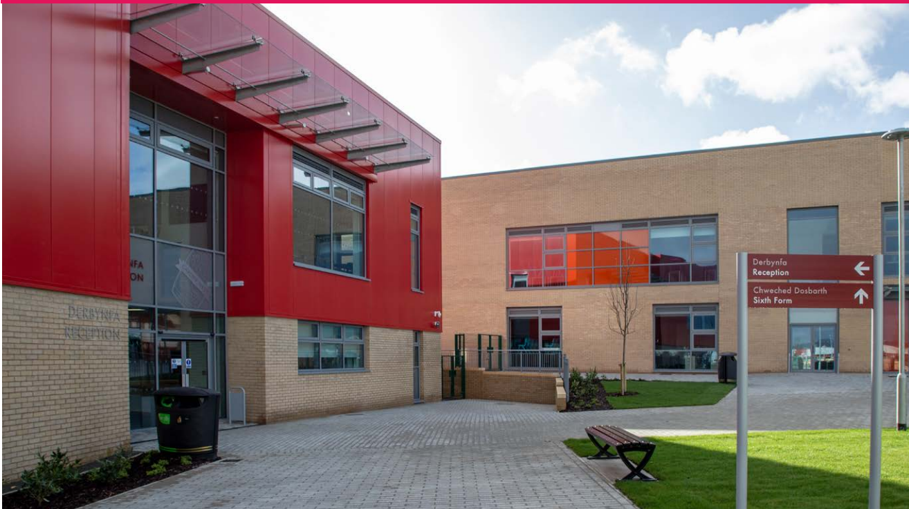
Cardiff West Community High

After determination, Cardiff Council would let everyone affected by the proposal know what the decision was. It will also be published on the Council's website.